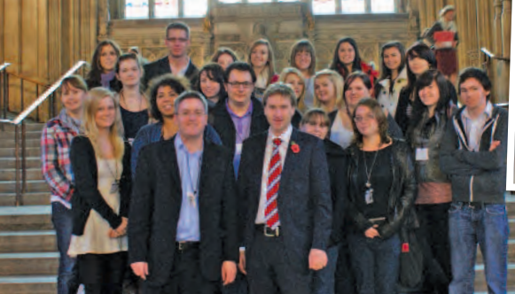
University of Winchester students visit in November 2010 A