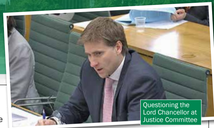
Questioning the Lord Chancellor at Justice Committee