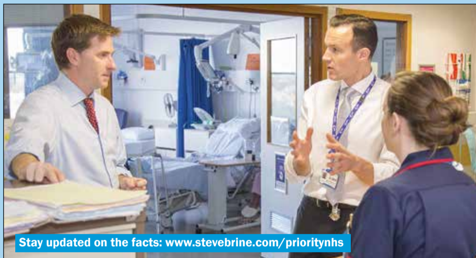
Stay updated on the facts: www.stevebrine.com/prioritynhs

"I remain committed to keeping the best services in Winchester but to do so in a way that is sustainable and above all, safe. Some of the things being put about locally are the height of irresponsibility but I will continue to focus on the facts. After almost five years as the MP here, and someone