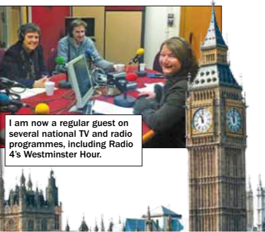
I am now a regular guest on several national TV and radio programmes, including Radio 4's Westminster Hour.

Since 2010 I have worked hard as a backbench MP in Parliament – and supporter of the coalition Government – but have also shown I am an independent minded MP. Of course I support the Prime Minister and his Deputy when they do the right thing (and stick to it) but I won't be an MP who slavishly follows the Government whips. There have been issues, such as demanding a referendum on our relationship with the EU and Nick Clegg's poorly thought through plans for Lords reform, where I have voted against a 3-line whip and if necessary I would do so again.