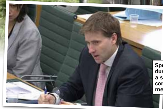
Speaking during a select committee meeting.

Constituents who would like a tour of Parliament or to climb Big Ben need only get in touch. Larger school, college or university groups can also be arranged. Please contact me as overleaf.