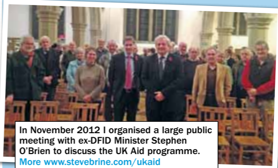
In November 2012 I organised a large public meeting with ex-DFID Minister Stephen O'Brien to discuss the UK Aid programme. More www.stevebrine.com/ukaid

announced the decision which will bring 420 new primary places online by September 2014. This will include a new all-through school at Westgate in Fulford where there remains much detail still to be worked out on local travel plans and a compromise must be reached with residents. In addition we have the enlargement of Winnall Primary School and St Peter's Catholic Primary School. Additional investment will also be made by the Conservative-run council at All Saints Primary School in Highcliffe, Harestock Primary School and Western Primary School. More details at www.stevebrine.com/schoolplaces