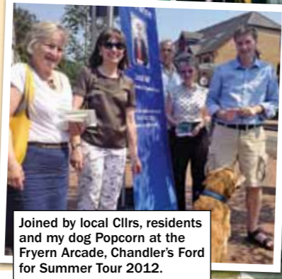
Joined by local Cllrs, residents and my dog Popcorn at the Fryern Arcade, Chandler's Ford for Summer Tour 2012.

Some people believe MPs put their feet up each Summer and some MPs may even do that! I on the other hand prefer to embark on a Summer Tour each July and August, taking my surgery into the heart of local communities, knocking on doors (for no reason other than to say hello) and holding street surgeries. My Summer Tour for 2013 kicks off on 22nd July in Kings Worthy. If you would like the team to visit your area or even to hold a special open surgery in your community at some future date, please get in touch. More details of Steve's Summer Tour are at www.stevebrine.com/summertour