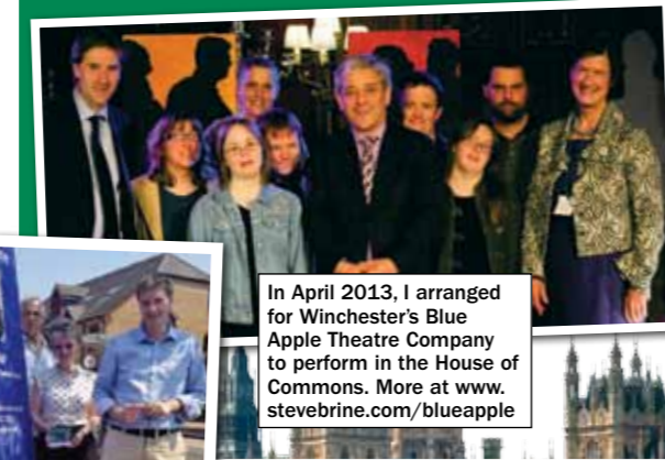
In April 2013, I arranged for Winchester's Blue Apple Theatre Company to perform in the House of Commons. More at www.stevebrine.com/blueapple