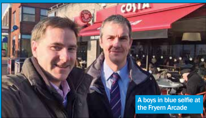
A boys in blue selfie at the Fryern Arcade