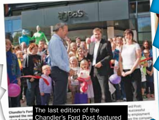
Chandler's Ford Post featured good news on local jobs at local employer Ageas

On the agenda were issues such as police response to 999 calls, how residents can confidently respond to such behaviour within the law and how the police are using evidence to issue warnings, and even bring some prosecutions, following recent events in the area.