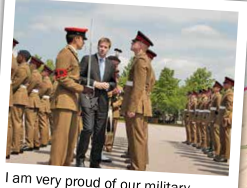
I am very proud of our military