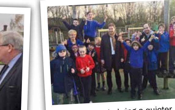
Our campaign to bring a quieter surface to the M3 was met with cheers at Shepherds Down School when it came good in Dec 2014.