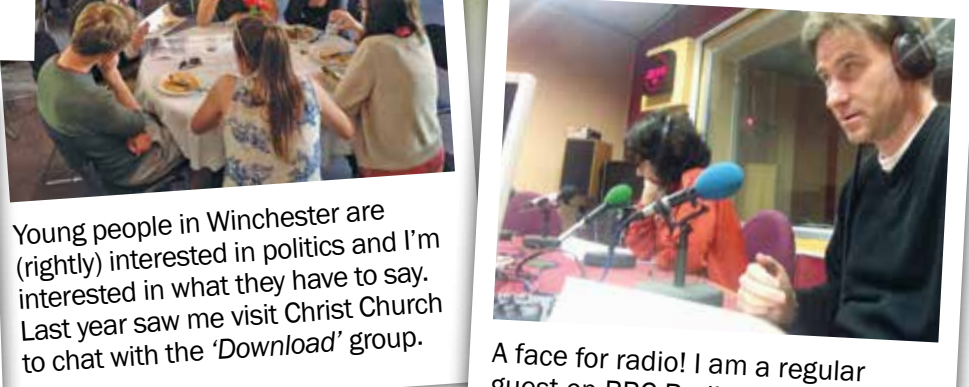
guest on BBC Radio 4's Westminster Hour programme.