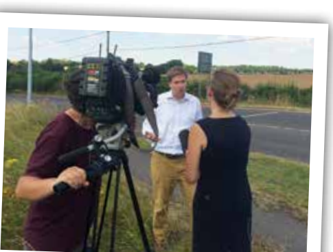
Pitt Vale is a green and pleasant piece of land South of Winchester. Here speaking to BBC South Today about why we must protect it.