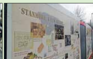
And coming next – more new homes at the former New Queen's Head site in Stanmore