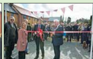
Barron Close in Micheldever opened in February 2014