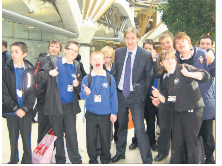
Students from Osborne School in Winchester give a big thumbs up to their day in Westminster.