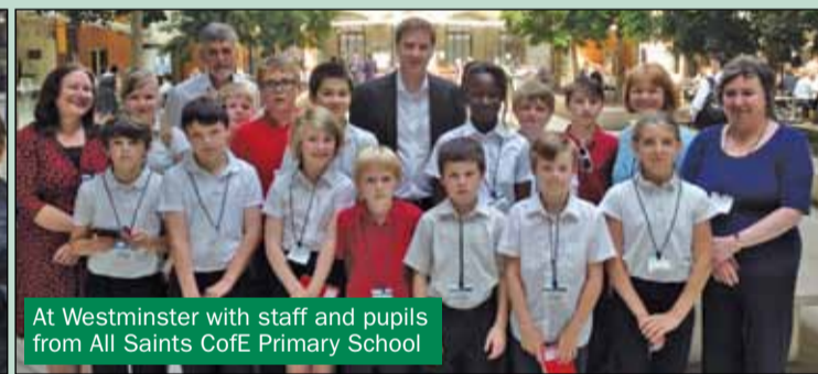
At Westminster with staff and pupils from All Saints CofE Primary School