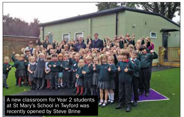
A new classroom for Year 2 students at St Mary's School in Twyford was recently opened by Steve Brine