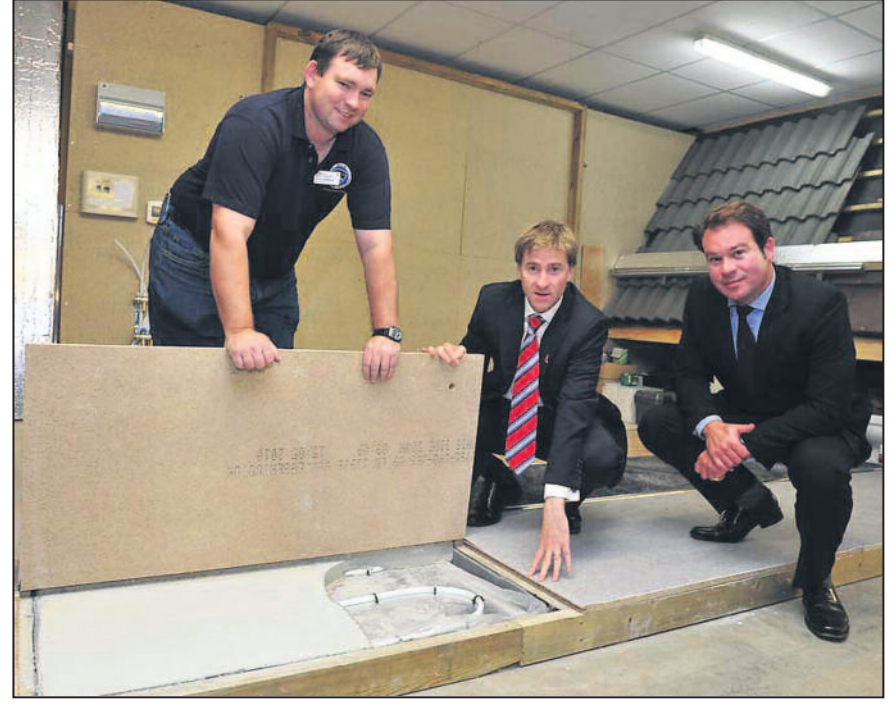
the centre recently including those hoping to install the under-floor

A strong advocate of creating jobs in the green industry, local MP Steve Brine met with students training at