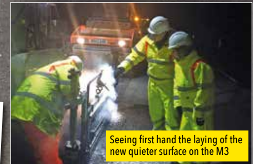
Seeing first hand the laying of the new quieter surface on the M3